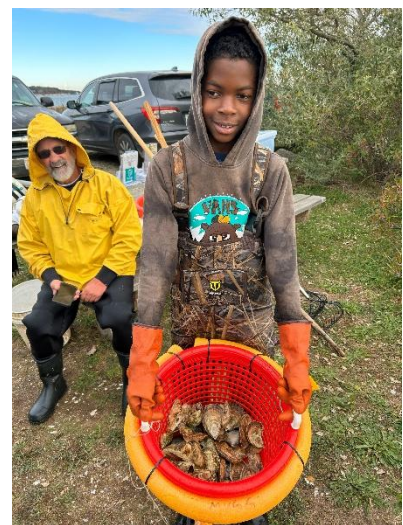
A nice harvest "All about Oysters" October 26, 2025